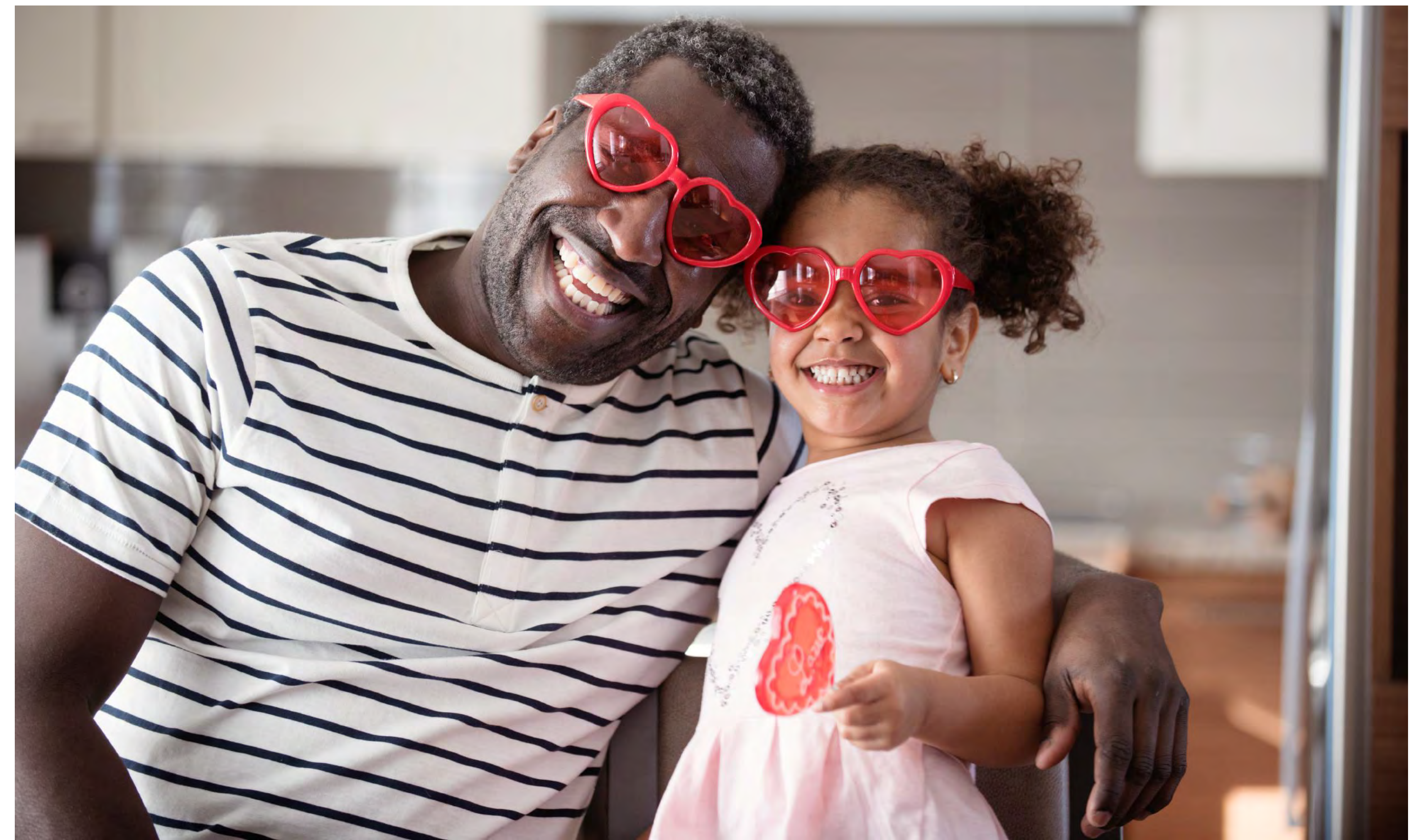
Working to keep black families together & children connected to their culture

A: I appreciate that management recognizes the importance of this work. It's very rewarding when colleagues say the consultations were helpful, when they have an "Aha" moment and begin to understand how Anti-Black Racism was affecting a family they are working with and have made changes in their practice to reflect this. But we still have a lot of years of undoing and unlearning.