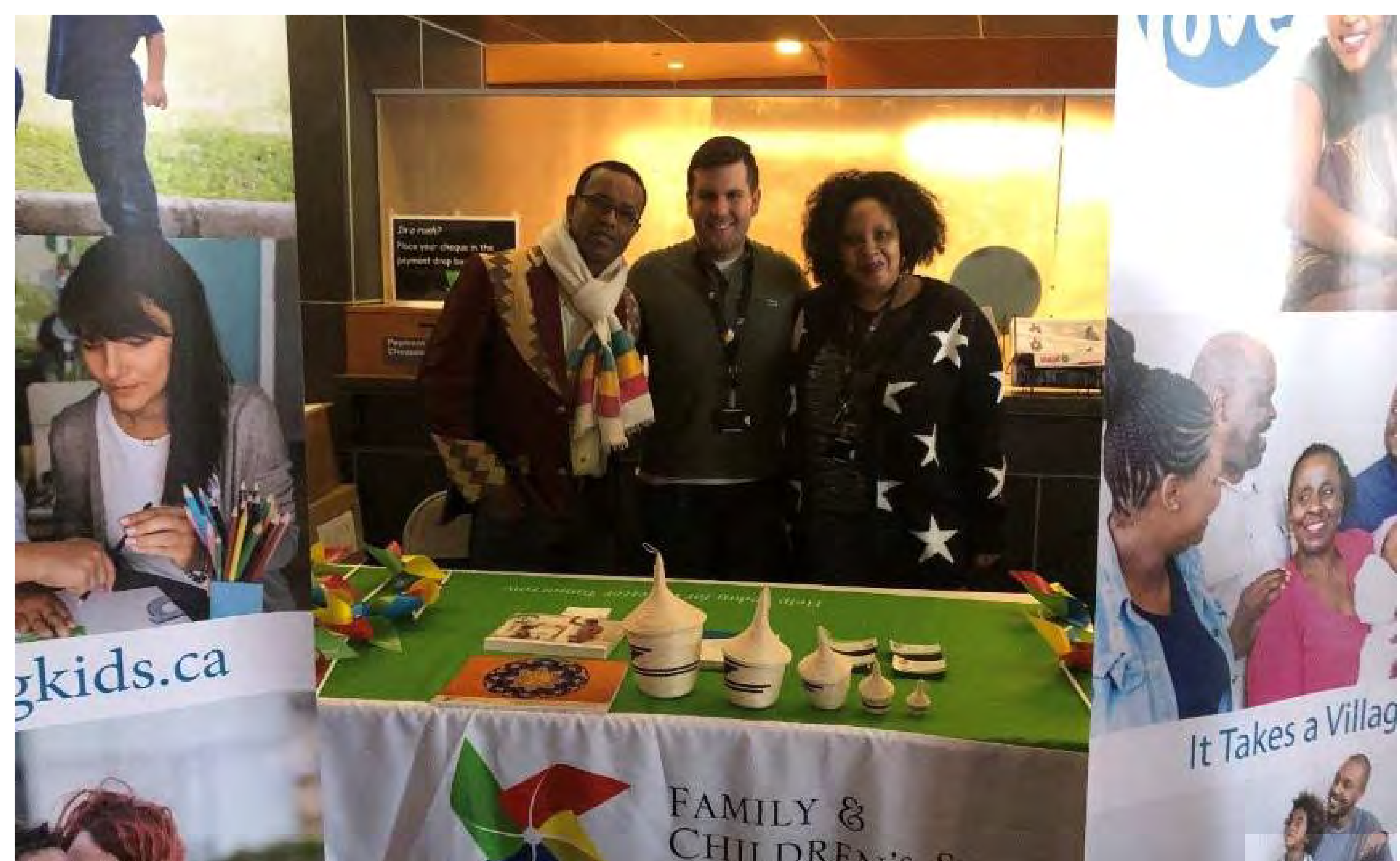
Bring on the Sunshine African Festival. Kitchener, February 2019

A: The provincial One Vision, One Voice 2016 research report highlighted the racial disproportionality and disparities. The report listed 11 Race Equity Practices to serve as a guide for the child welfare sector. The work we're doing here will help address the over-representation of Black children in care and improve outcomes for Black families. You can find out more information about One Vision One Voice at the Ontario Association of Children's Aid Societies website at http://www.oacas.org/what-we-do/onevisiononevoice